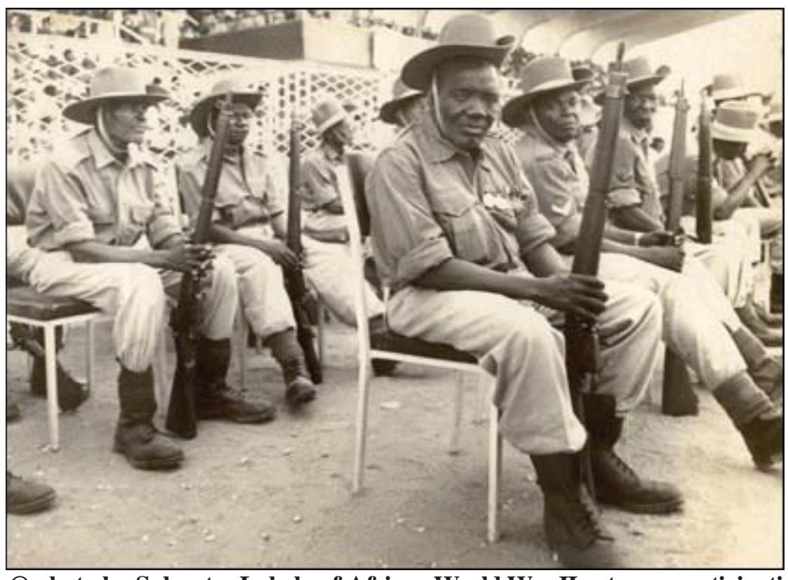
of African World War II veterans participating in Tanzanian World War II memorial