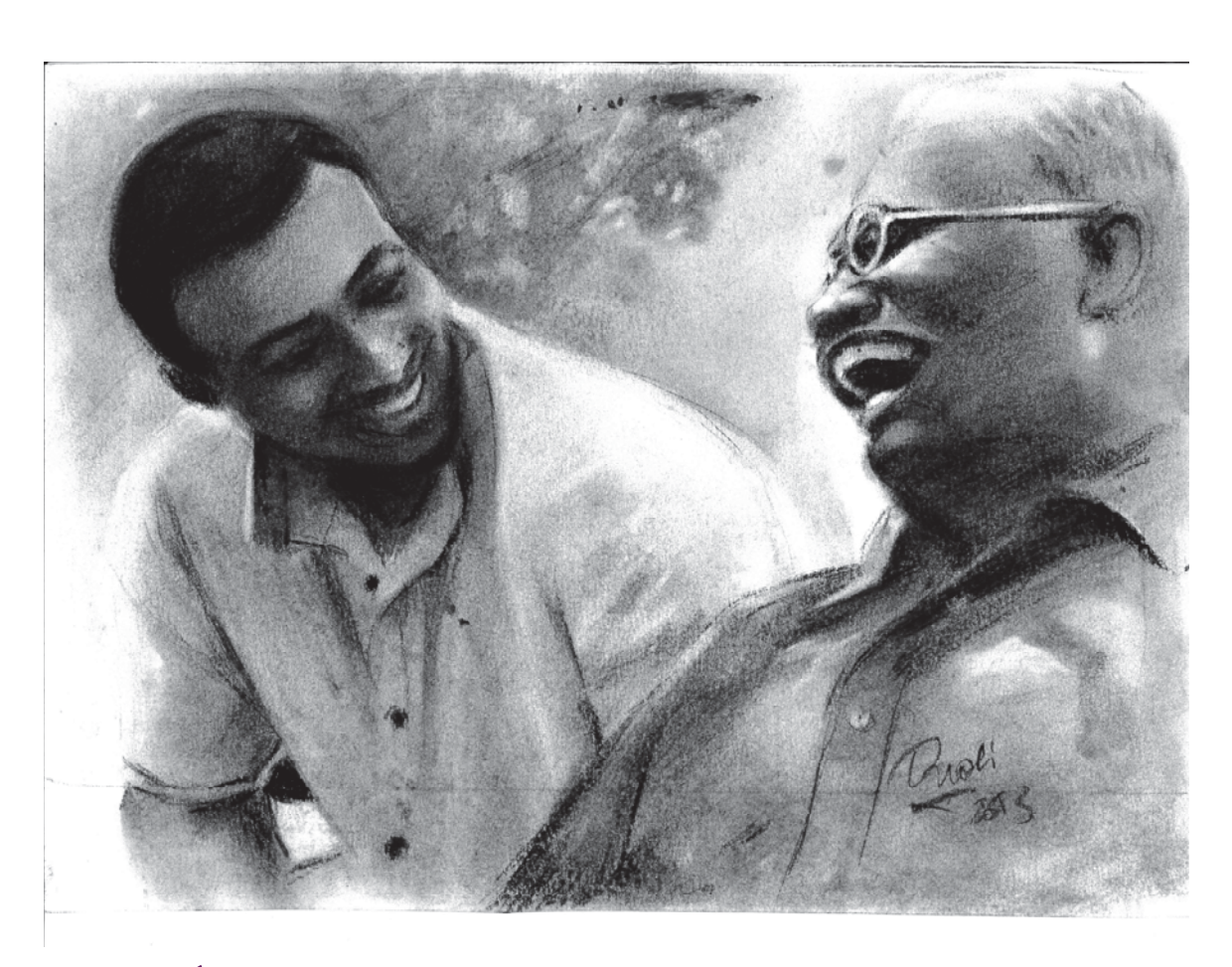
African Soldiers during World War II