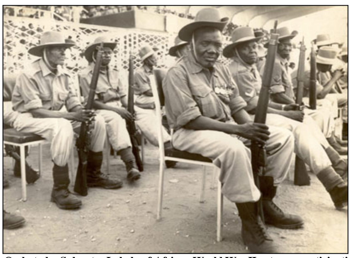
of African World War II veterans participating in Tanzanian World War II memorial