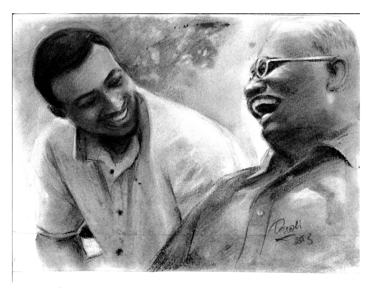
African Soldiers during World War II